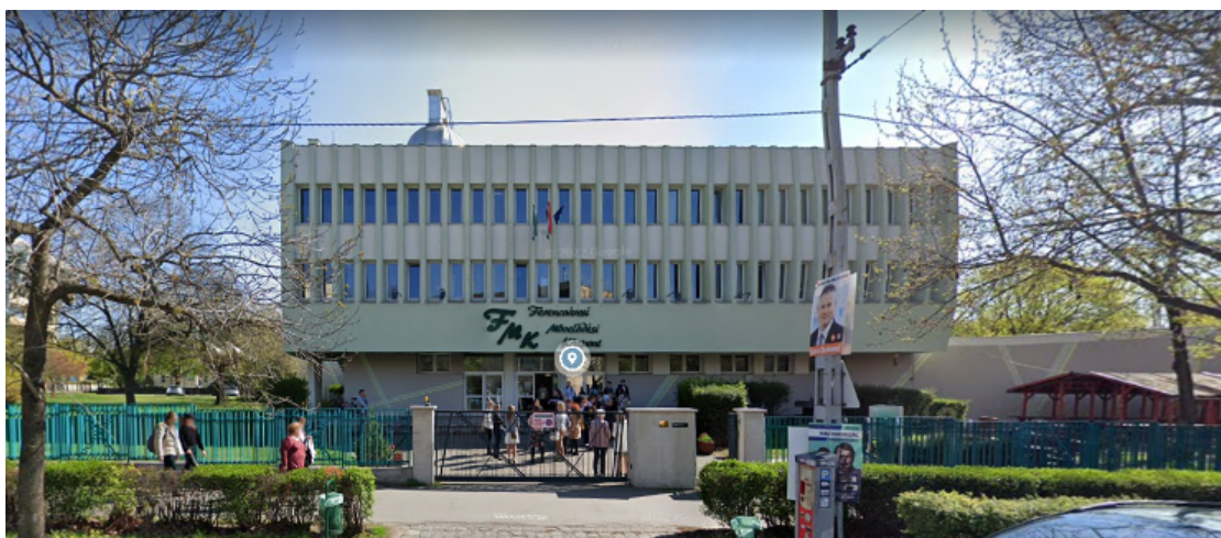
Streetview of the meeting location.