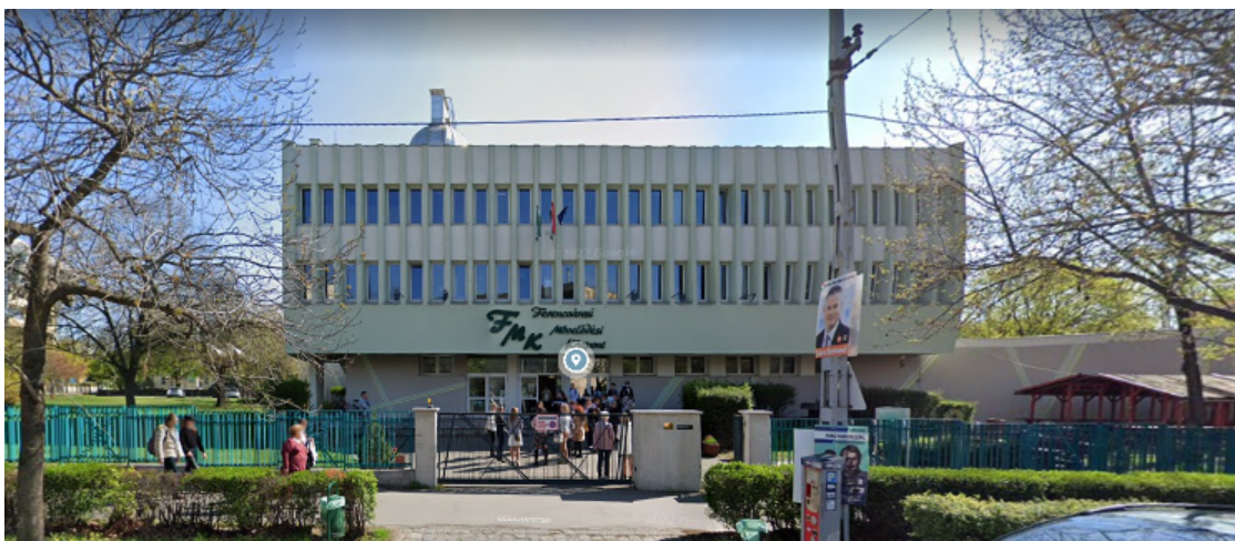
Streetview of the meeting location.